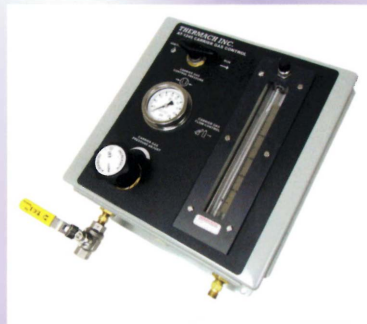
AT-1245 /Carrier Gas Flow Control

The AT-1245 is a HVOF carrier gas flow control designed to interface an AT-1200HP rotary powder feeder with the Diamond Jet® HVOF gun.