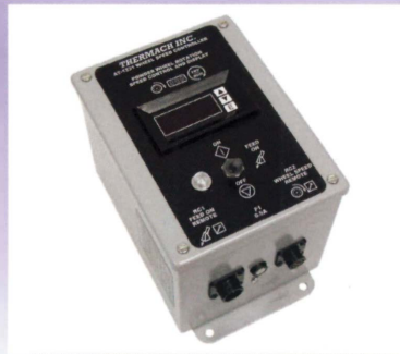
AT-1231 Wheel Speed Control

The AT-1231 is a closed-loop remote wheel speed controller for use with rotary powder feeders. The AT-1231 controls both Feed On/Off functions and wheel speed.