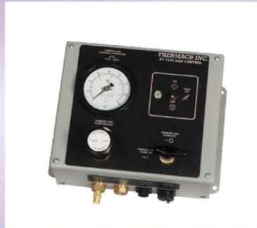
AT-1230 Gas Flow Control

Thermach's commitment to quality ensures the latest technology and production methods are used in their manufacturing products. Because of this, Thermach Inc. is a leader in the thermal spray and machining industry.