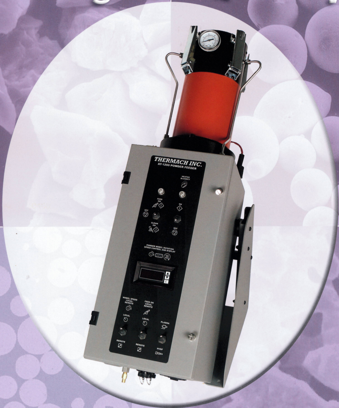
AT-1200 Rotary Powder Feeder

THERMACH INC. THERMAL SPRAY AND MACHINING