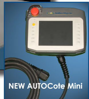
NEW AUTOCote Mini