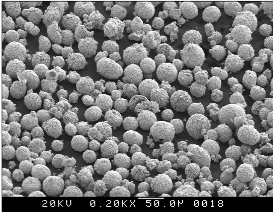
Figure 1: Typical Powder Morphology (SEM 200X)